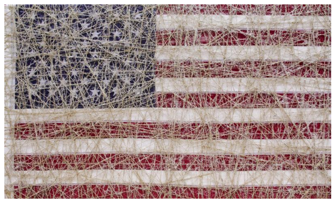
Bernie Taupin, "Sleeping Beauty", fabric, twine, fixative on canvas, 60x36 inches, Waterhouse & Dodd, New York+London